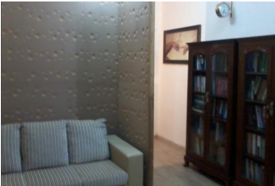
Healthcare Quality Resource Center

The Institute for Healthcare Quality is a not for profit organization registered under the maharashtra charities act. iHQ is the first institute in india fully dedicated to healthcare quality and safety and is a leader in the learning , teaching and research of the healthcare quality sciences.